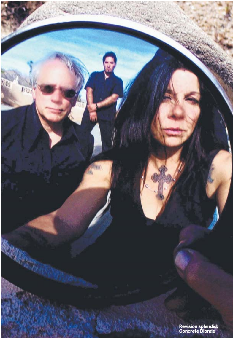
Revision splendid: Concrete Blonde

Phantom Pains EP (Universal) is out now.