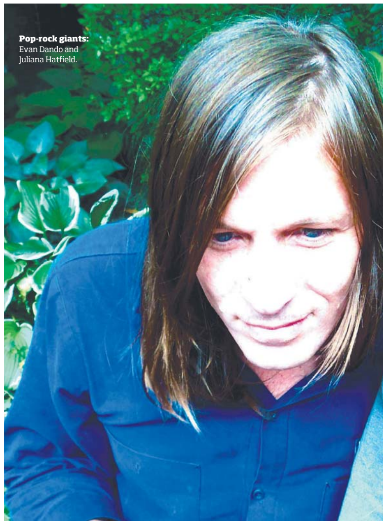
Pop-rock giants: Evan Dando and Juliana Hatfield.